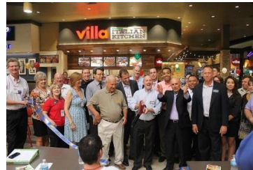
Food Hall by Villa at the Arizona Mills Mall