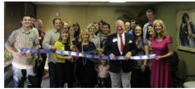
All About Compression

Southwest College of Naturopathic Medicine (SCNM) will officially break ground Jan. 8 on a new 47,000-square-foot mixed-use building. The campus expansion supports the college's record-enrollment numbers, growing patient volume in the medical center, as well as future plans to add new degree programs and community classes to match the growing interest in naturopathic medicine. For information about SCNM, visit www.scnm.edu .