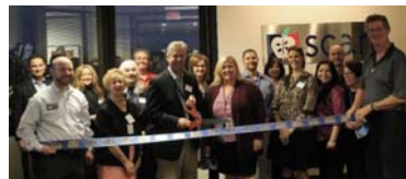
SCAN Health Plan Arizona