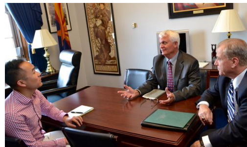
Rep. Sinema's team meeting with United Dairymen of AZ. They process 90% of Arizona's milk in Tempe.