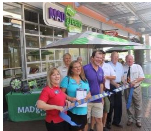
MAD Greens at Tempe Marketplace Ribbon Cutting