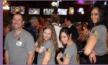
Tempe Chamber staff in shirts provided by Remember the Name Promotions & Apparel

No, we're not Barbie dolls, but we are willing to let you dress us up. We've recently started a Technology Fundraiser to help offset the cost of new computers and operating systems. Let us be your walking billboards! Find out how it works here.