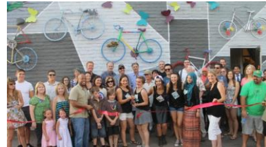
here on the corner/Resolana project

Tempe residents can participate in the update of the Tempe Transportation Master Plan by attending a series of meetings which will help familiarize them with current and proposed projects and encourage the creation of a shared vision for the plan. The meetings will cover topics related to Tempe's proposed arterial roadway, bike, pedestrian and transit priority corridors; Tempe's short- and long-term bicycle and pedestrian network; potential candidates for traffic calming and/or streetscape improvement; and more.