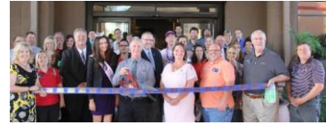
Country Inn & Suites Phoenix Airport South

Town Lake by an additional 100 feet, increasing the water surface to both sides of the Town Lake Pedestrian Bridge. The steel gate system offers high levels of safety, reliability, durability and flow flexibility while allowing Town Lake to transition into a river during major flow events. For fact sheets, FAQs and video of how the dam will function, visit www.tempe.gov/damreplacement .