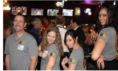
Tempe Chamber staff in shirts provided by Remember the Name Promotions & Apparel

Country Inn & Suites, By Carlson, Phoenix Airport South received the "Certificate of Excellence" from TripAdvisor for 2014. The hotel has won the award for three years in a row, even while undergoing a complete renovation! The friendly staff members are available to assist you with all of your hotel needs. Learn more at http://www.countryinns.com/phoenix-hotel-az-85040/usapsaz .