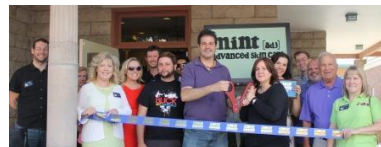
Mint Advanced Skin Care