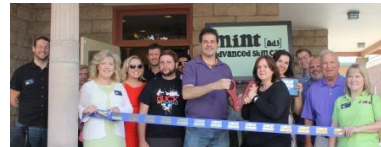
Mint Advanced Skin Care

Click here to view the Tempe Chamber's Board of Directors