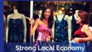
Strong Local Economy

THE BUSINESS ADVOCATE TEMPE CHAMBER OF COMMERCE