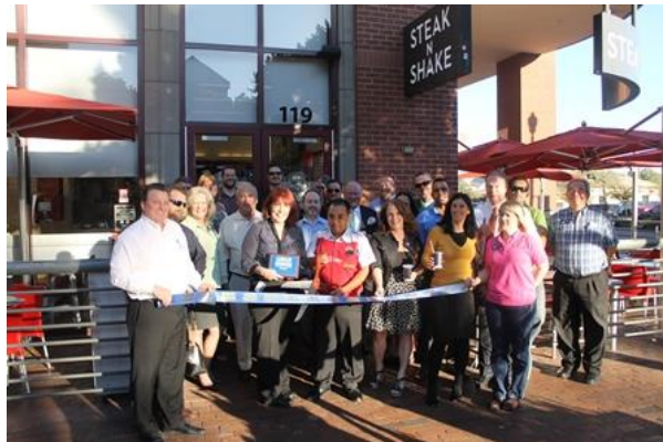
Stake N Shake