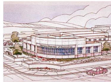
Our Office in 1996

It was 20 years ago when the Tempe Chamber entered a new age as we moved from cramped quarters in the downtown Tempe Mission Palms Hotel into bright shiny offices, designed and built just for us. On Aug. 31, our staff leaves the home that served admirably for 20 years. Soon, the iconic building will give way to the wrecking ball - relegated to a footnote in Tempe history. Our new office will be located at 1232 E. Broadway Rd., Suite 211. More>>